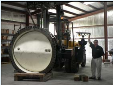
Val-Matic AWWA Butterfly Valve