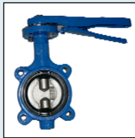
J&S Lug & Wafer Butterfly Valves