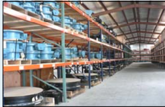
Over 40,000 Sq. Ft. of Inventory