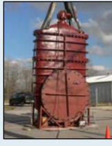
72" J&S AWWA Gate Valves