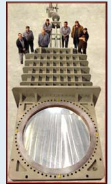
96" Lined Valve Bonneted Knife Gate