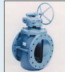
Val-Matic Plug Valve