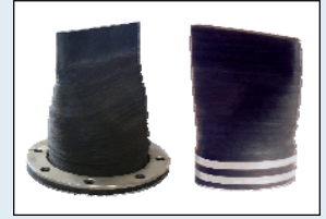
HedFlex Duckbill Check Valves 1/2" - 96"