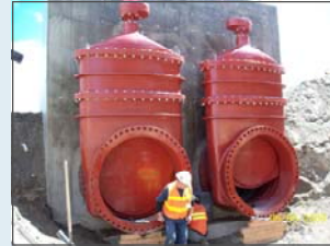
60" J&S AWWA Gate Valves