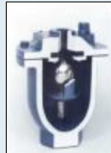
Val-Matic Air Valve