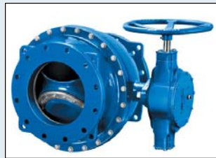
Val-Matic Rubber Seated Ball Valve 4" - 48"