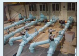
Lubbock Pump Station J&S Gate Valves & Surgebuster Check Valves