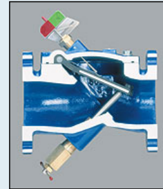
Val-Matic Surgebuster Check Valve