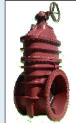
J&S Resilient Seated Gate Valve 2" - 72"