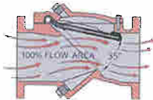
Surge Buster Check Valve